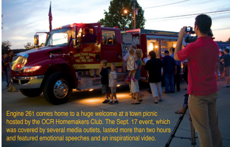
Engine 261 comes home to a huge welcome at a town picnic hosted by the OCR Homemakers Club. The Sept. 17 event, which was covered by several media outlets, lasted more than two hours and featured emotional speeches and an inspirational video.