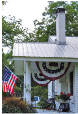
Happy Independence Day, America!