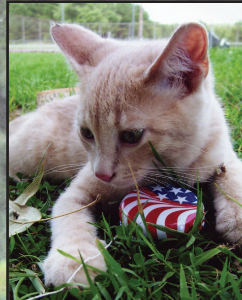
Patriotic Kitten