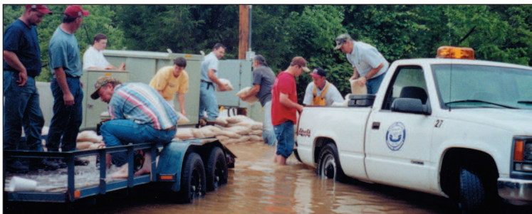
NHTC crews and volunteers work to sandbag telephone equipment during the May 2003 flood.

The status of the project is pending, while awaiting environmental reviews.