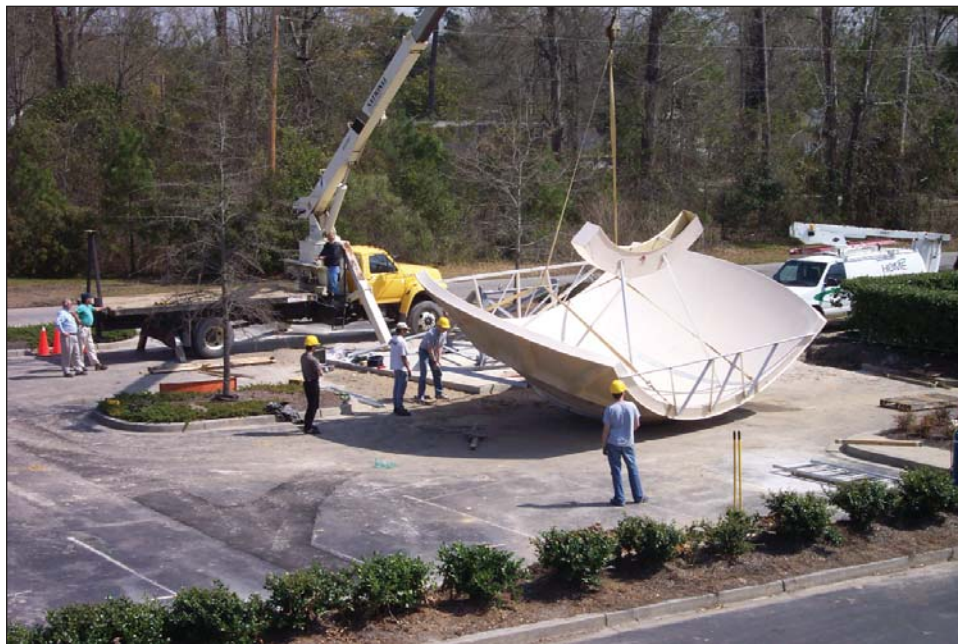
The Simulsat satellite antenna coming soon to NHTC will provide a broad range of benefits to cable television customers. Here, crews install a similar antenna at Home Telephone Company, an independent telecommunications company in South Carolina.

The new antenna is part of NHTC's overall plan to upgrade its entire system. The Simulsat will work in tandem with the new IPTV head end. The new cable equipment will be put to use next year to serve existing cable customers; however, its full potential will be realized as NHTC deploys optical fiber connections throughout its service area.