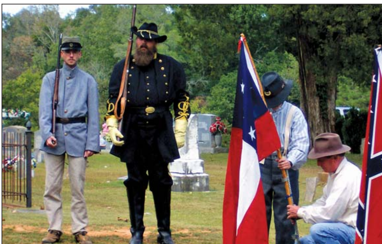
Members of the Egbert J. Jones Camp, Sons of Confederate Veterans are shown presenting the colors during the ceremony.

After the last ceremony, the New Hope Historical Association furnished refreshments for those assembled. ▲