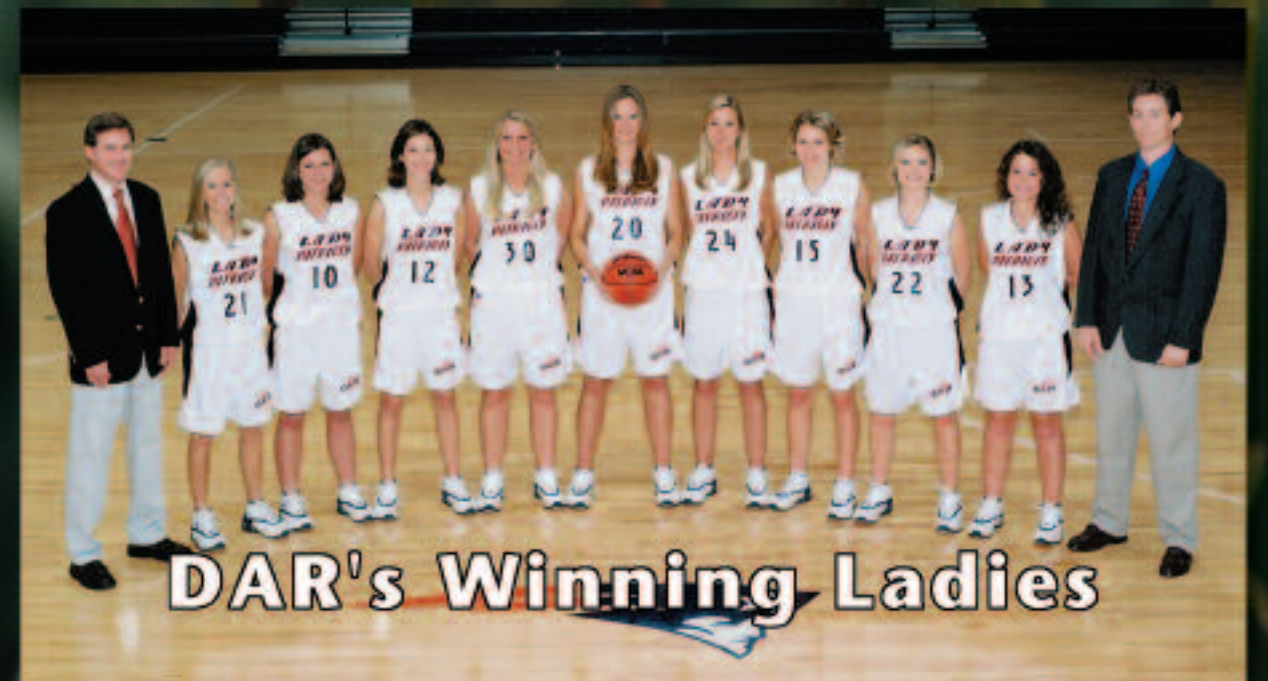
DAR's Winning Ladies