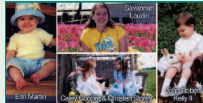
PHOTO CONTEST: We're looking for your favorite Summertime photos to use in the June issue of The Communicator . Send photos to: NHTC • P.O. Box 452, New Hope, Alabama 35760. We will select winners for publication in our next issue! If your entry is selected, you'll see your photo in print, plus receive a free gift from NHTC.